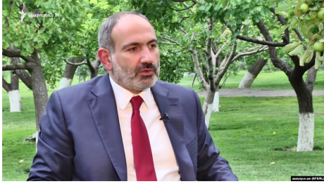
Armenia -- Prime Minister Nikol Pashinyan speaks to RFE/RL, Yerevan, July 17, 2019.

(Yerevan – RFE/RL)– An Armenian court issued has an arrest warrant for the former head of a Yerevan hospital related to former President Serzh Sargsyan after a law-enforcement body brought more corruption charges against him.