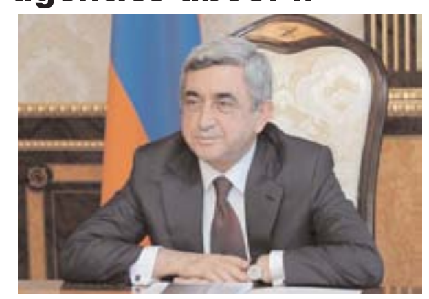
holding of free and fair elections is an important legal and democratic objective of each state", said the President.

"Of course, the negative phenomenon considerably sets off the legitimacy of any elections and neutralization of such undesirable influence and ensuring and