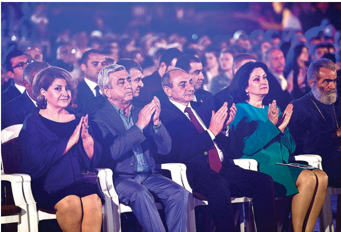
The leadership of Armenia and NKR