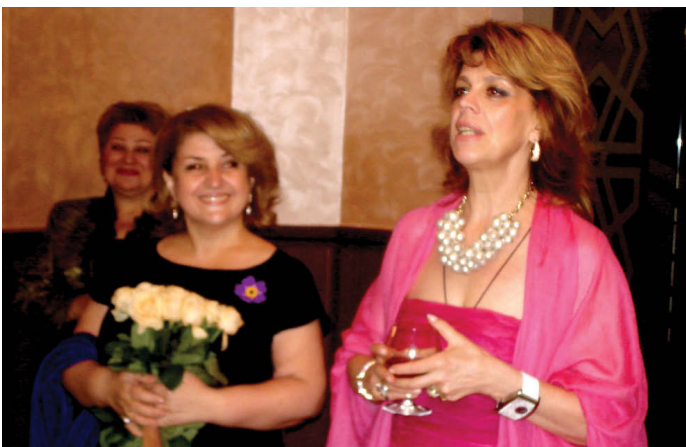
Lyubov Kazarnovskaya with the First Lady of Armenia Rita A. Sargsyan