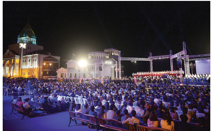
At the Stepanakert Renaissance Square