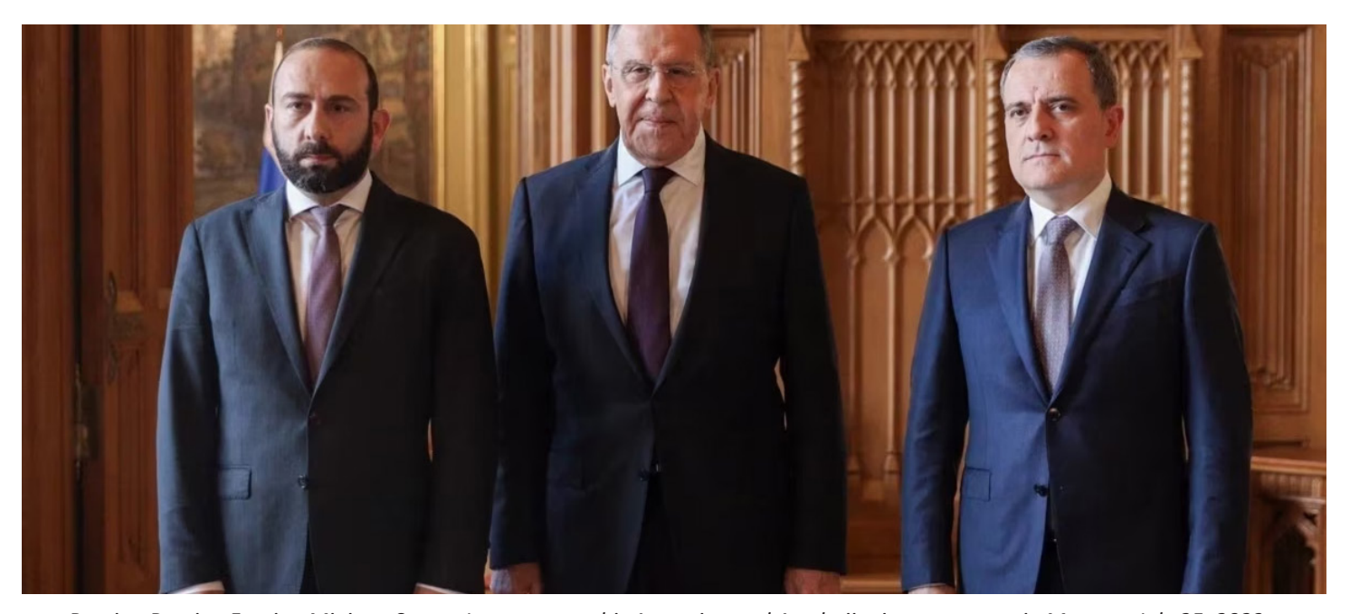
Russia - Russian Foreign Minister Sergey Lavrov meets his Armenian and Azerbaijani counterparts in Moscow, July 25, 2023.

Azerbaijan's illegal blockade of the Lachin Corridor and Nagorno Karabakh complicates the negotiation process, Foreign Minister of Armenia Ararat Mirzoyan stated on July 25 at the trilateral meeting with Russian Foreign Minister Sergey Lavrov and Azerbaijani Foreign Minister Jeyhun Bayramov, which took place in Moscow.