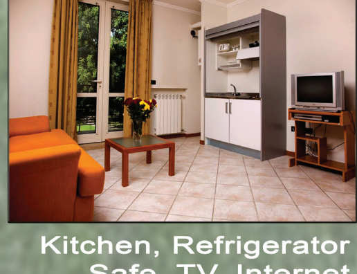
Safe, TV, Internet

Warm Welcome 24/7 Security Free Cafe & Bar