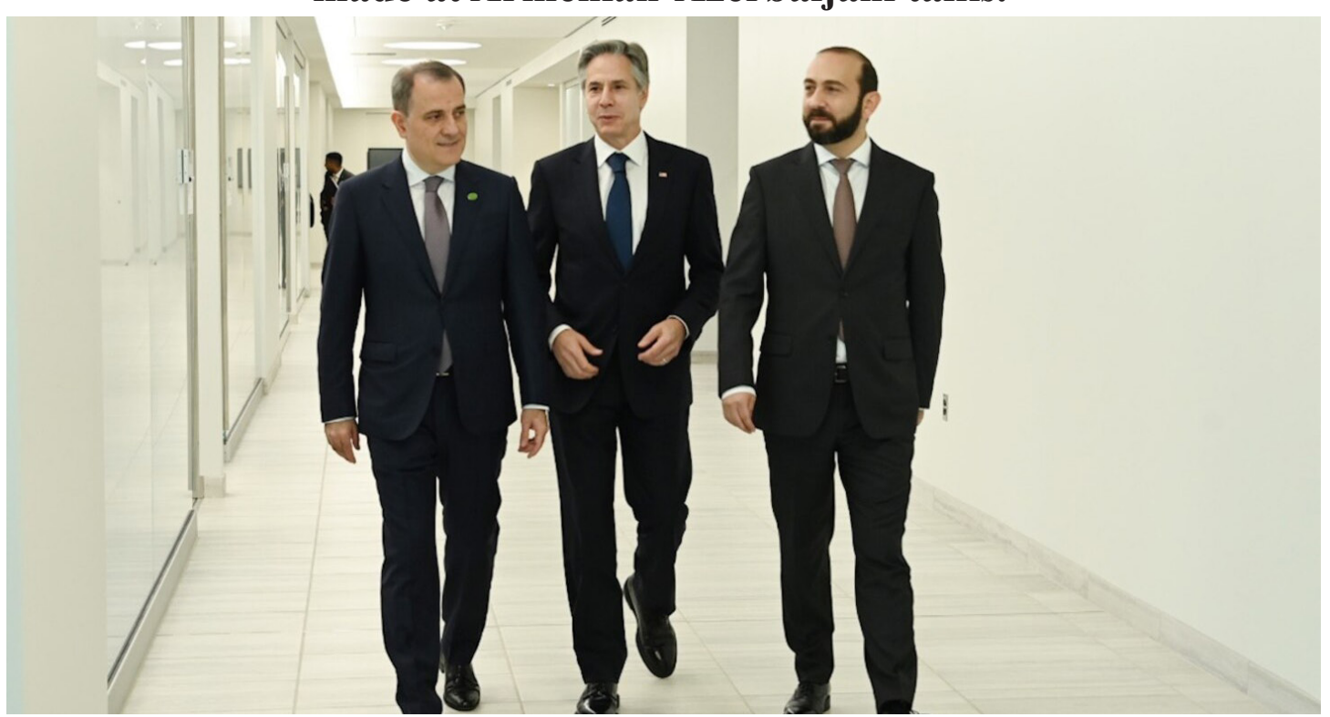
U.S. - U.S. Secretary of State Antony Blinken meets Armenian Foreign Minister Ararat Mirzoyan and Azerbaijani Foreign Minoster Jeyhun Bayramov, Washington, June 27, 2023.

Closing the talks, Blinken said the two sides had made "further progress" on "the objective of reaching an overall final agreement in the weeks and months ahead" on Nagorno-Karabakh, a breakaway region under effective Armenian control.