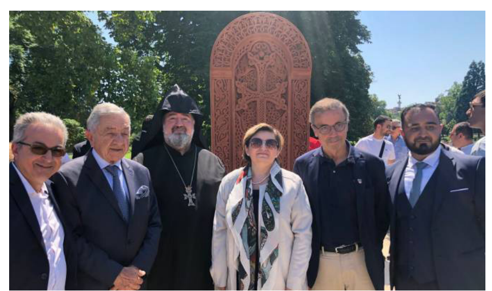
An Armenian cross-stone was inaugurated on June 25 at a public park in central