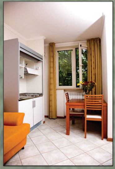
Modern Rest Rooms