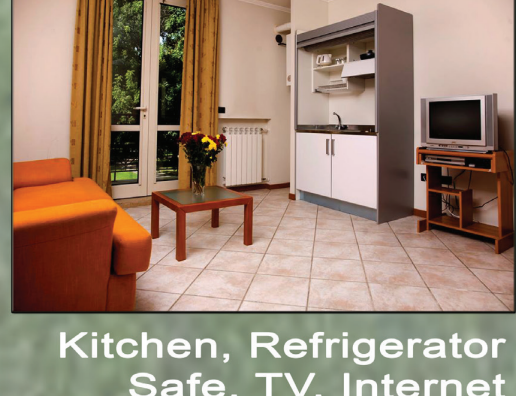
Safe, TV, Internet

Warm Welcome 24/7 Security Free Cafe & Bar