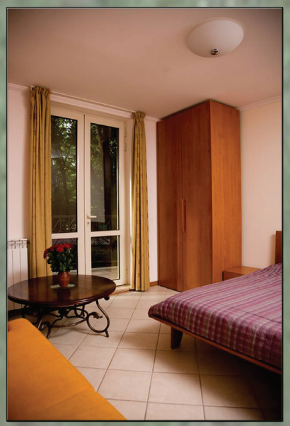
All Conveniences Air Conditioned Apartments

Warm Welcome 24/7 Security Free Cafe & Bar