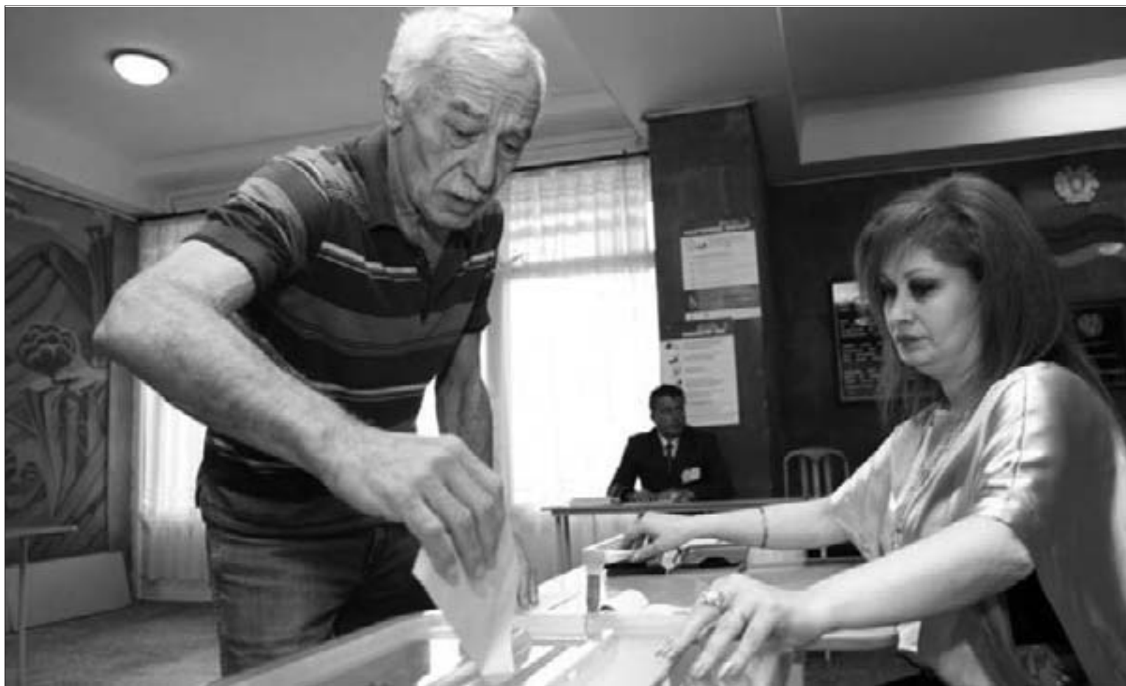
A voter casts a ballot at a polling station in Yerevan, 6 May 2012.