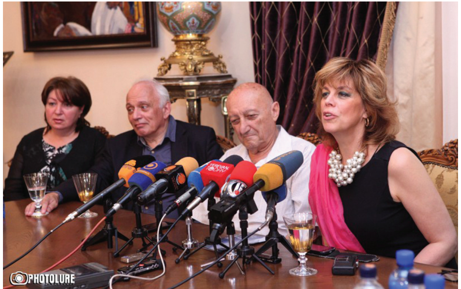
Artistic director of the concert, opera singer Lyubov Kazarnavskaya, speaks to reporters in Yerevan

"Eternal rest grant unto them, O Lord, and let perpetual light shine upon them. May they rest in peace. These are the most important words in the lyrics of the Requiem. We'll try to sing about that