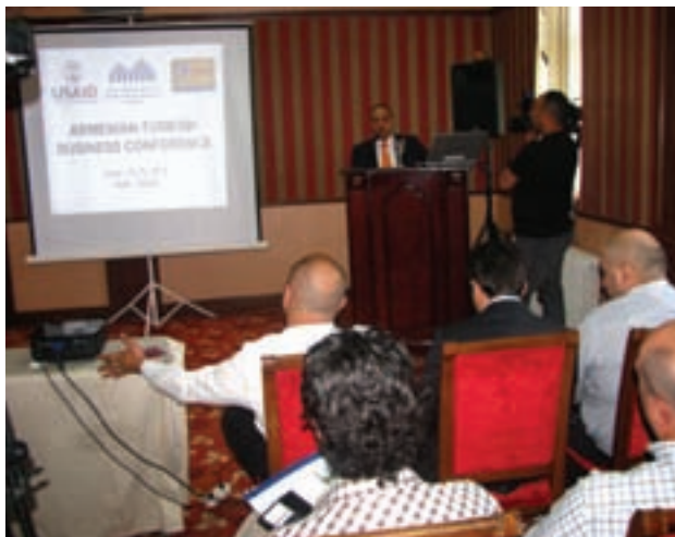
Third Turkish-Armenian Business Conference. June 2012, Kars, Turkey

new areas of cooperation between businesses in Armenia and Turkey. UMB(E) works closely with the Turkish-Armenian Business Development Council (TABDC) in Turkey to promote advancement of common interests across the region through establishment of business