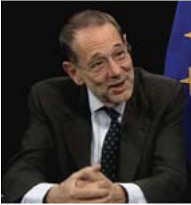
Javier Solana, former Secretary-General of NATO and EU High Representative for the Common Foreign and Security Policy, published an article on the post-U.S. & post-China elections state of world. Find full article below.

On November 6, either Barack Obama or Mitt Romney will emerge victorious after an exhausting electoral race, setting the wheels in motion for the coming four years. An ocean away, on November 8, more than 2,000 members of the Chinese Communist Party (CCP) will gather in Beijing. Approximately a week later, the members of the Politburo Standing Committee will walk out in hierarchical order, preparing to take charge of a growing country of 1.3 billion people.