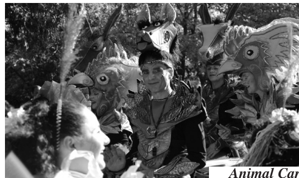
Animal Carnival Parade

On November 2 VivaCell-MTS announced about just another success in the cooperation between Synopsys Armenia, VivaCell-MTS and the European Regional Academy.