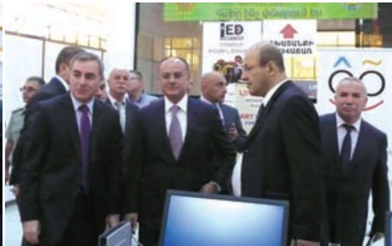
...and Defense Minister Seyran Ohanyan also was there