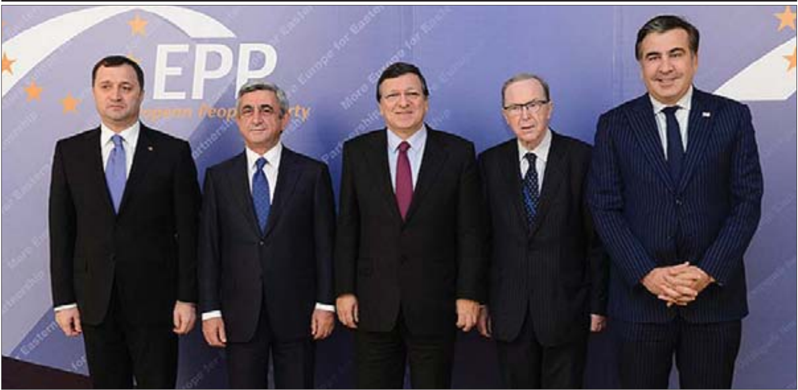
The summit was attended by Armenian President Serzh Sargsyan, Georgia's President Mikheil Sahakashvili, Prime-Minister of Moldova Vladimir Filat, President of the EPP Wilfried Martens and President of the European Commission Jose Manuel Barroso.