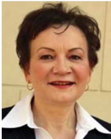
By Gayane Ghandilyan