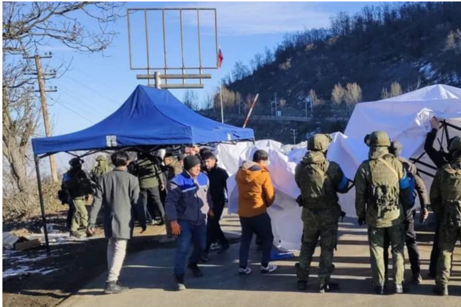
Nagorno-Karabakh - A group of Azerbaijanis block the road connecting Karabakh to Armenia, December 12, 2022.

On December 18 the Lachin Corridor remains blocked by Azerbaijan, the Nagorno Karabakh authorities said.