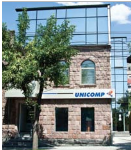
Any PC user knows what is located in the address Charents Str. # 37