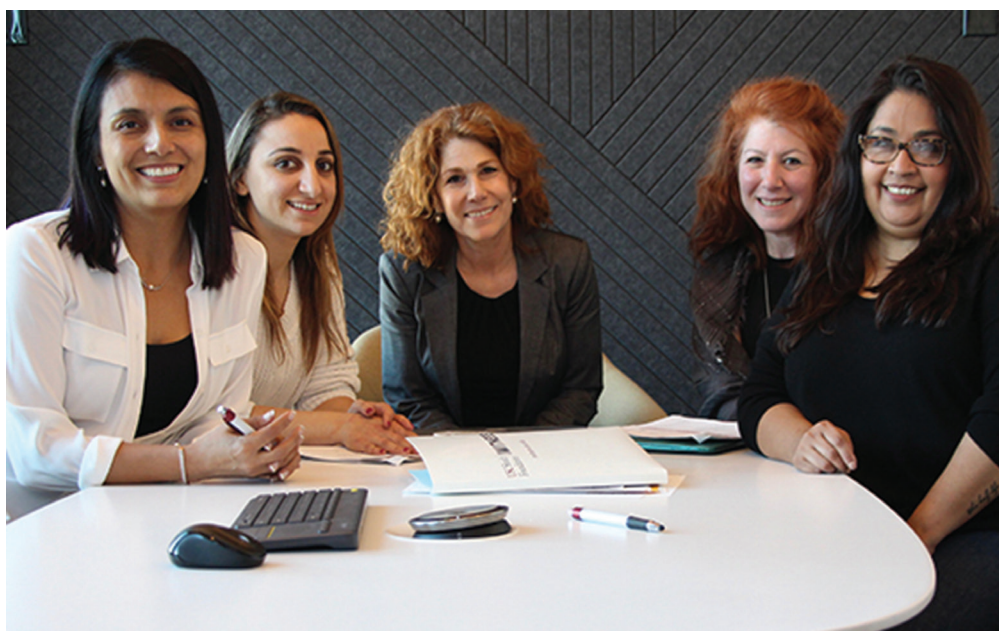
Exhibit booths and workshop sessions were provided at social studies conferences and full-day teacher-trainings were carried out in California, Connecticut, Michigan, New Jersey, Texas, and Chicago, where GenEd interacted with hundreds of high school history teachers.

GenEd attended more educational conferences and hosted more professional training workshops than ever, introducing a wider spectrum of teachers to the value of teaching about the Armenian Genocide and the pattern of genocides that followed.