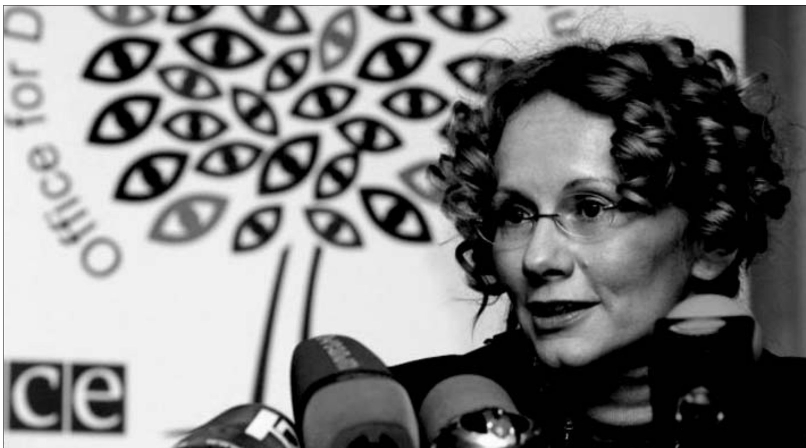
Radmila Sekerinska, head of the OSCE election observation mission, at a news conference in Yerevan, 22 March 2012.