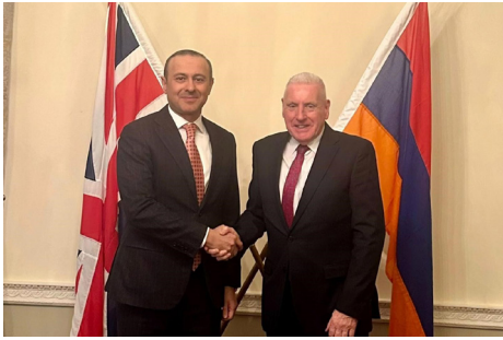
Secretary of the Security Council of

Armenia, Armen Grigoryan, met with UK Minister of State for Defense Vernon Coaker during his visit to London.