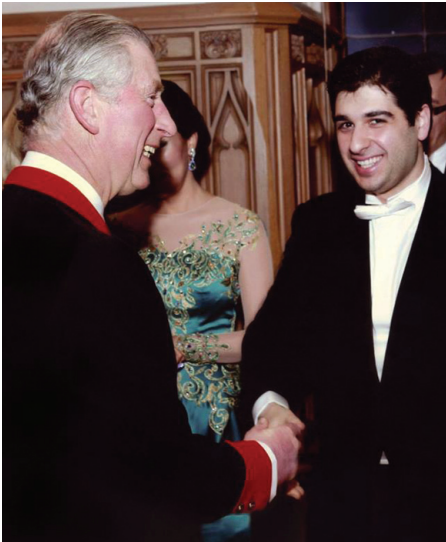
Sergey Smbatyan with HRH Prince Charles

The opening concert of the 6th Armenian Composing Art Festival (ACAF) dedicated to the 85 th anniversary