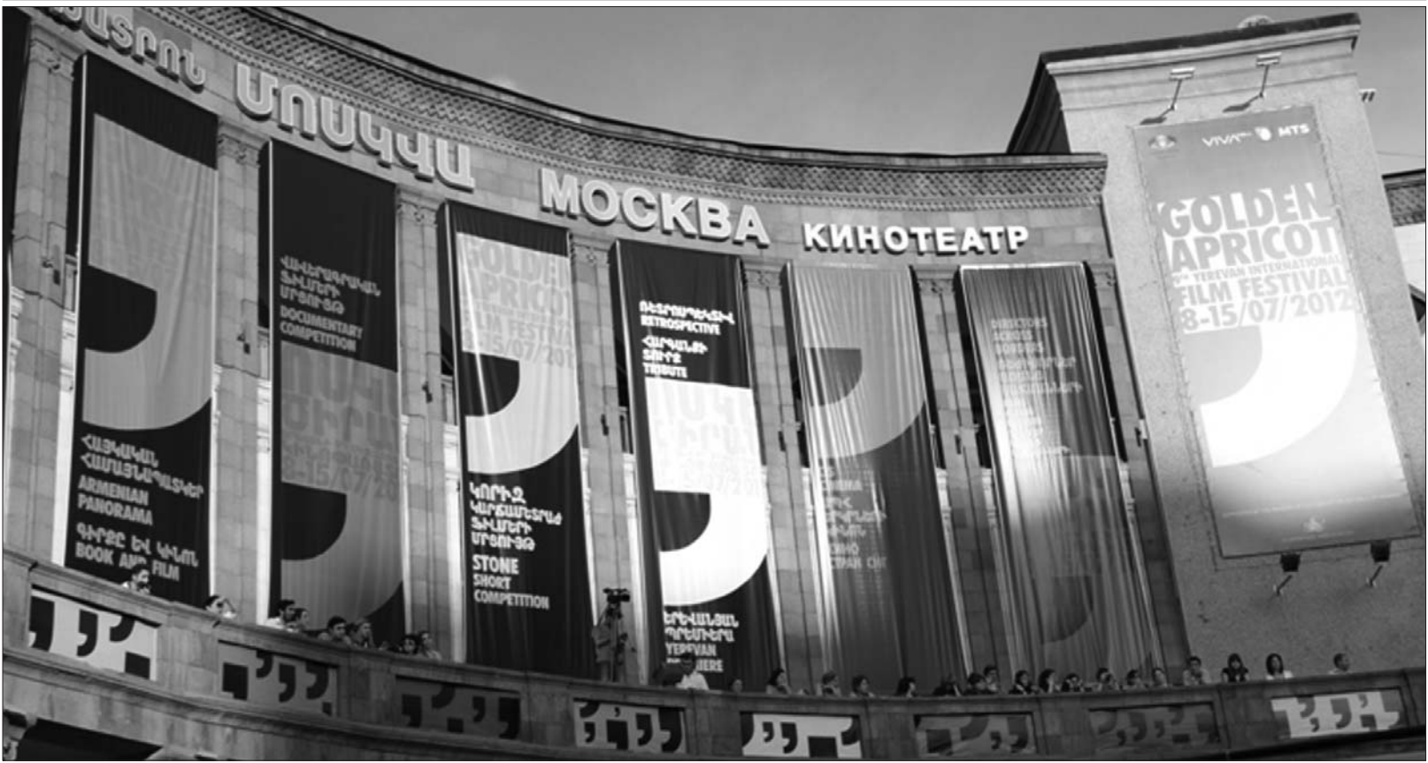
The Ninth Golden Apricot Intl Film Festival Was Held in Yerevan on July 8-15