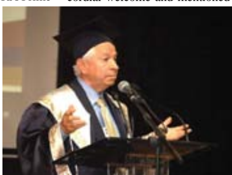
"Never give up!"