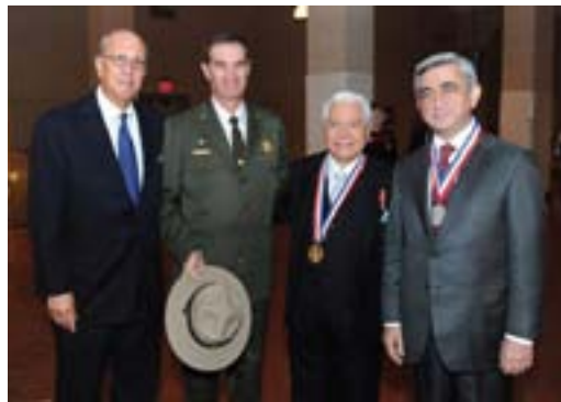
Ellis Island, NY, 23.09.2011