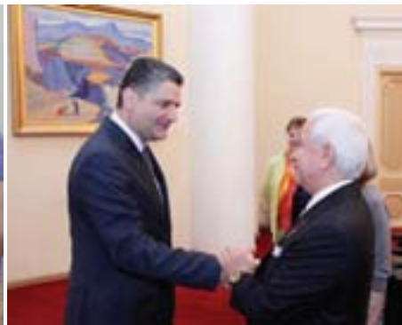
With the RA PM Tigran Sargsyan