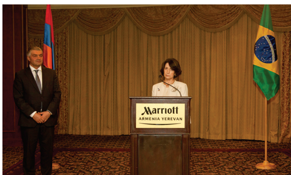
The Ambassador addressing the guests