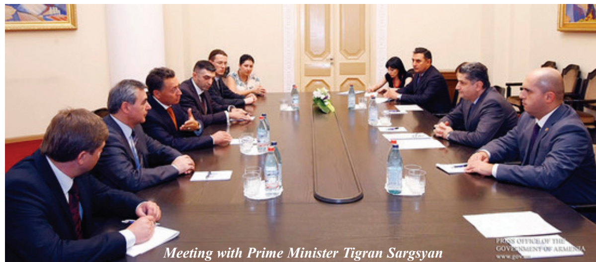
Meeting with Prime Minister Tigran Sargsyan