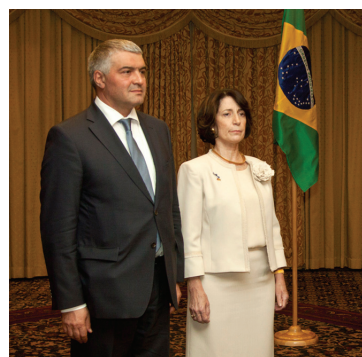
Listening National Anthems...