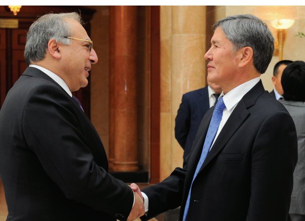
...And with the Presidents, of Kyrgyzstan, Mr Almazbek Atambaev and of Tajikistan, Mr Emomali Rakhmon

There are some CIS countries at the moment whose development is dynamic, others, perhaps, are not so successful, but by and large