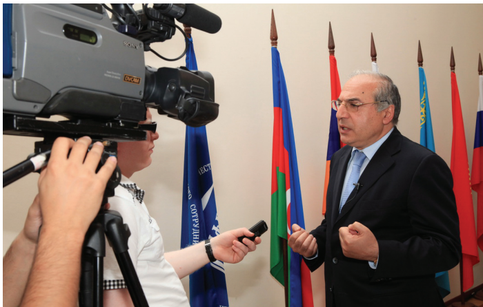
Our colleagues have always questions to Executive Director of the IFESCCO