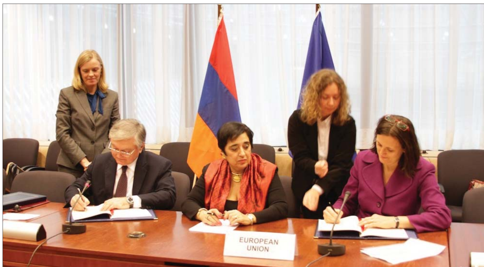
Foreign Minister Edward Nalbandian, his Cypriot counterpart Erato Kozakou-Marcoullis and EU Commissioner for Home Affairs Cecilia Malmstrom sign the agreement in Brussels during a session of the EU-Armenia Cooperation Council.