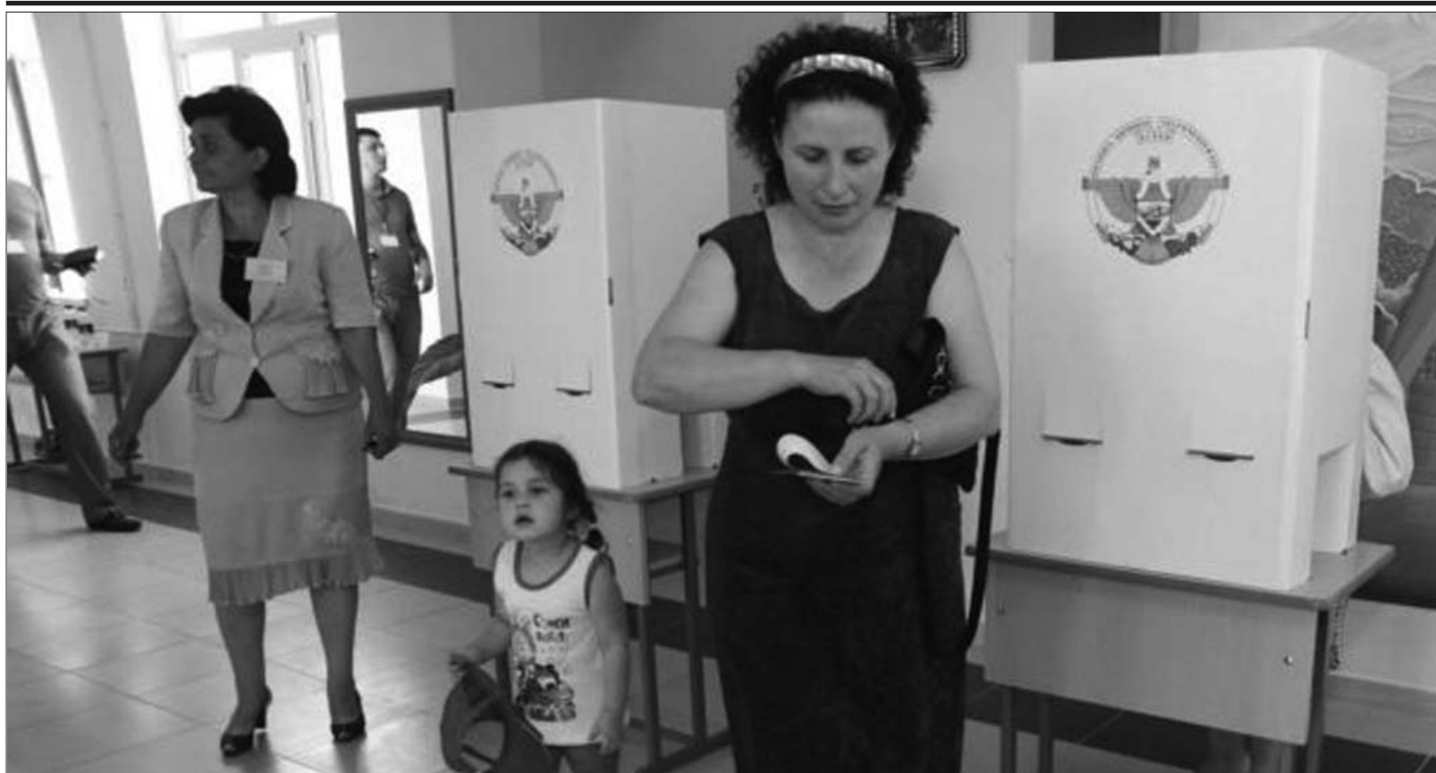
Nagorno-Karabakh - Voters at a polling station in Stepanakert, 19 Jul 2012