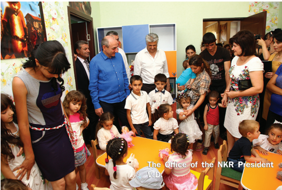
The Office of the NKR President V.D.

the village. The President noted that widening the network of the pre-school institutions in the countryside was one of the priorities of the state, and everything possible would be done to have kindergartens corresponding to contemporary conditions in rural areas.