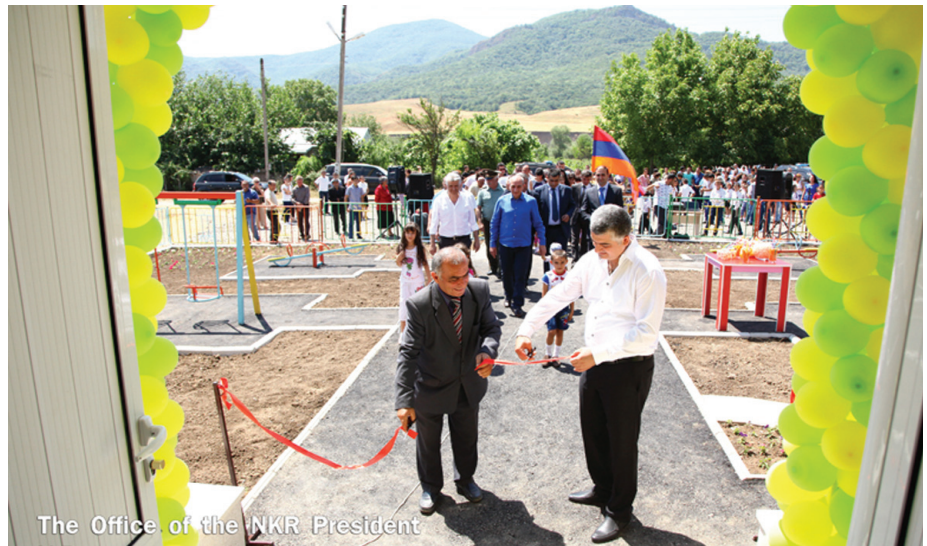
The Office of the NKR President

Bako Sahakyan thereafter partook in a solemn ceremony of opening of a new kindergarten in