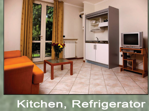
Kitchen, Refrigerator Safe, TV, Internet

Warm Welcome 24/7 Security Free Cafe & Bar