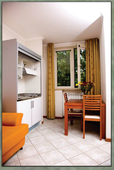
Modern Rest Rooms