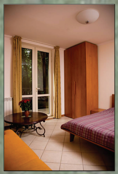
All Conveniences Air Conditioned Apartments

Warm Welcome 24/7 Security Free Cafe & Bar