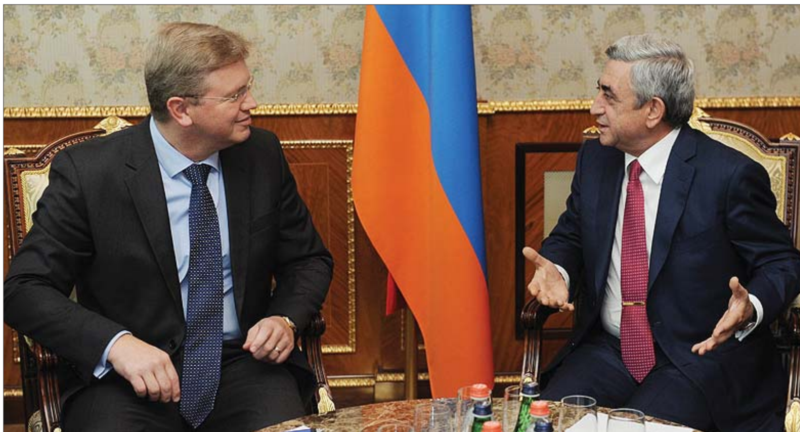
Serzh Sargsyan hosts EU Commissioner for Enlargement and European Neighbourhood Policy Štefan Füle. 27.09.2012