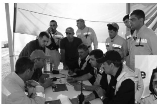
Armenian rescuers at Georgia 2012...