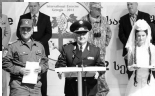
...And the awarding ceremony