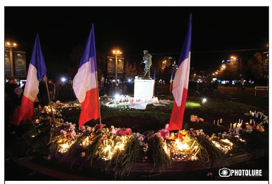
People light candles on French Square in memory of the victims of terror attack in Paris, France

"We express our condolences and support to the friendly people of France," said