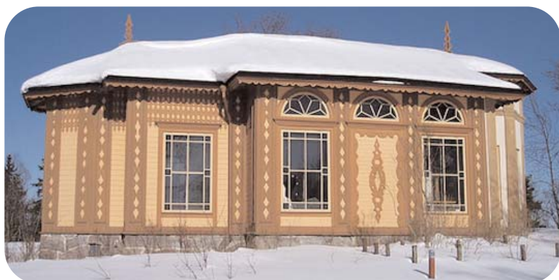
The chapel at a court yard will be Stockholm's 192nd historic building

Armenian chapel and an artist's studio, according to Dagens Nyheter. Union of Armenian Associations in Sweden welcomes the news. "Armenians have for years expressed interest in the building and it has at some occasion used for holding an Armenian church service in the chapel. We hope it will remain as an important symbolic building of an interesting era in the Swedish cultural heritage" writes The Union of Armenian Associations in Sweden in a statement.