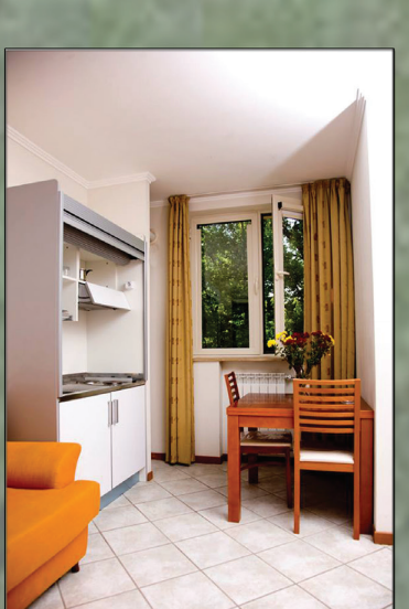
Modern Rest Rooms

Warm Welcome 24/7 Security Free Cafe & Bar