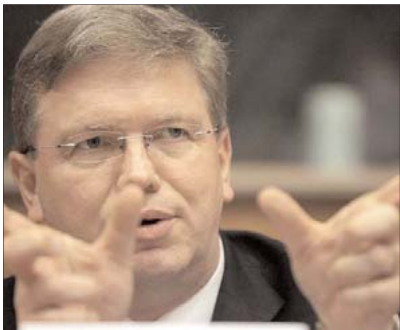
The EU Commissioner for Enlargement and Neighborhood policy Stefan Fule

The European Union continues to request the earliest possible closure of the Armenian NPP in Metsamor as "it cannot be upgraded to meet internationally recognized nuclear safety standards". The joint Document of the European Commission and EU