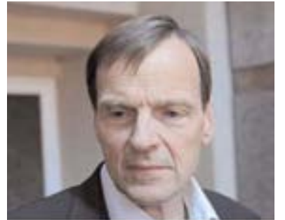
and Foreign Minister Edward Nalbandian.