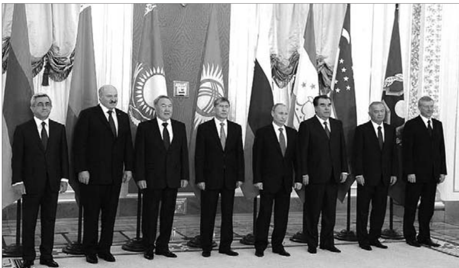
Serzh Sargsyan participates at the jubilee session of the CSTO Collective Security Council